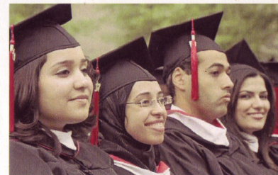
Rutgers-Newark graduating seniors, Commencement 2007

Cover painting by Bot Meng, survivor of the Cambodian genocide, reprinted by permission of the Documentation Center of Cambodia